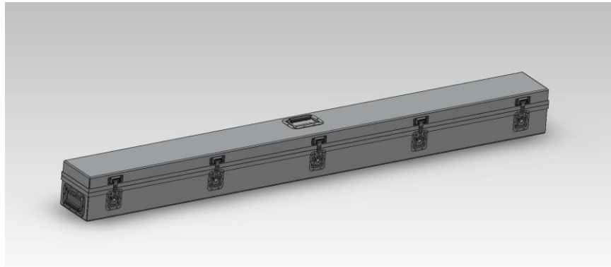
Front Profile - Closed

Weld Beads, Rivets Not Shown - Drawings to Demonstrate Case Configuration Only